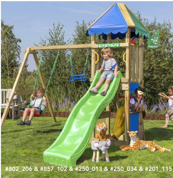
#802_206 & #857_102 & #250_013 & #250_034 & #201_115